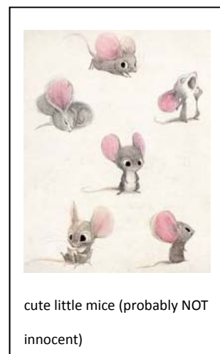
cute little mice (probably NOT innocent)